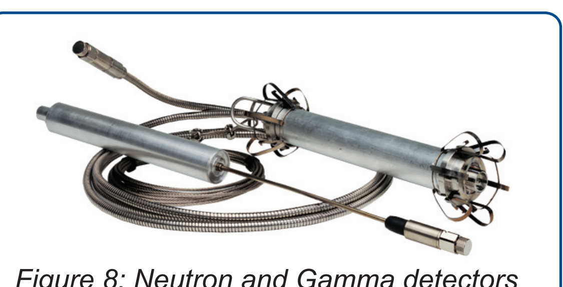
Figure 8: Neutron and Gamma detectors for highly sensitive radiation detection.

Resistive Glass drift tubes provide key benefits to the PHOTONIS IMS Engine, such as uniform electric fields with minimal radial