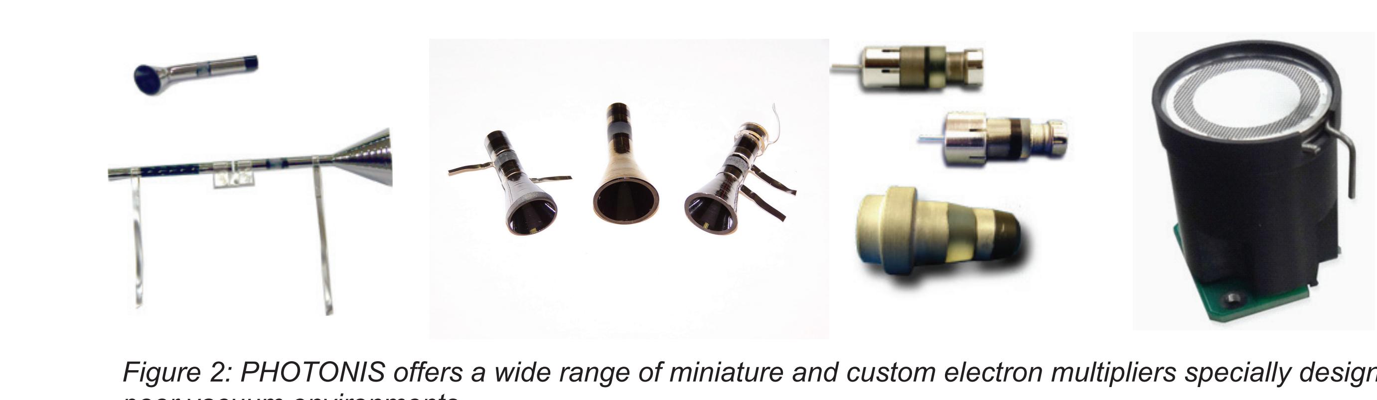
Figure 2: PHOTONIS offers a wide range of miniature and custom electron multipliers specially designed for operation in poor vacuum environments.

Spiraltron<sup>™</sup> Electron Multipliers are specifically designed for poor vacuum applications, such as portable mass spectrometers. Spiraltron<sup>™</sup> Electron Multipliers can operate effectively at pressures well into the 10<sup>-3</sup> Torr range, while compact MegaSpiraltron<sup>™</sup>, XPR MCP, and Daly detectors can all operate at 10<sup>-2</sup> Torr (Figure 2). Let PHOTONIS custom-design your next detector for your portable mass spectrometer requirements for superior poor vacuum performance and analysis.