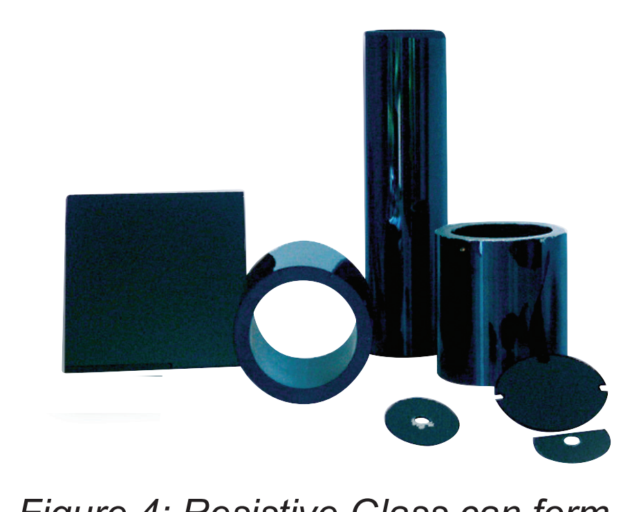
Figure 4: Resistive Glass can form a wide variety of MS components.

Figure 3: A full sized Resistive Glass capillary tube is displayed next to a set of miniature detectors and Resistive Glass inlet tubes optimized for portable mass spectrometry.