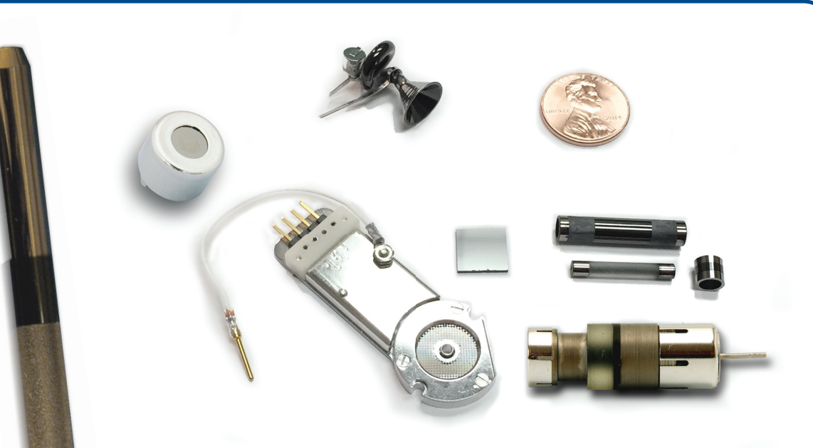
Figure 3: A full sized Resistive Glass capillary tube is displayed next to a set of miniature detectors and Resistive Glass inlet tubes optimized for portable mass spectrometry.

High Mass Time of Flight Detectors from PHOTONIS improve the detection efficiency of very high mass ions with significantly less complexity compared to traditional high-mass TOF detection solutions. This detector features a high sensitivity microchannel plate, a high-speed scintillator, and a photomultiplier which can detect both positive and negative ions with 30kV of isolation. This innovative solution features a gridless optic system that offers high sensitivity detection for mass ranges in excess of 100kDa. Ask us how we can design a custom detector for your next MCP-based Mass Spectrometer and maximize your mass resolution.